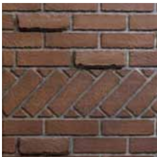
Banded Brick Liner