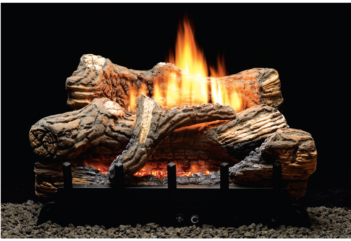
Trenton Ceramic Fiber Log Set and Vent-Free Burner Combination (VFDR-24LB)

The Trenton Log Set features richly detailed, hand-painted Ceramic Fiber logs mounted atop our Vent-Free Contour Burner. This complete set includes glowing embers to add to the illusion of a real wood fire at any heat setting. This competitively priced set is ideal for existing fireplaces and fireboxes and for new construction. Available in manual control, thermostat control, or remote-ready Millivolt – in 28,000 Btu, 34,000 Btu and 40,000 Btu.