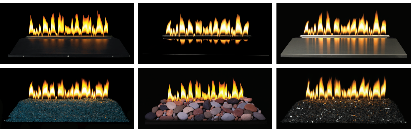
Top Row left to right: No Decorative Options, Polished Black Decorative Top, Brushed Stainless Steel Decorative Top. Bottom Row left to right: Blue Clear Decorative Glass, Medium Decorative Rocks and Accent Pebbles, Polished Black Decorative Glass. (Clear Frost Decorative Glass shown on opposite page)