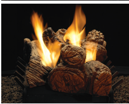
Opposite Side View (above) and End View (below)