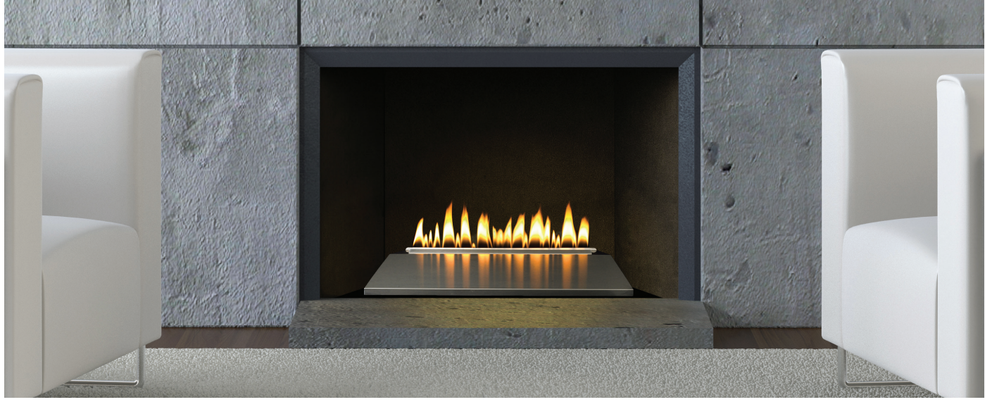
Loft Series Burner (VFRL-24) with Stainless Steel Decorative Top (DT-24-SS). Shown in existing masonry firebox.

A vent-free Millivolt Loft Burner may also be installed as a decorative appliance in a vented fireplace to provide ambiance and light – but without the heat. In a vented installation, the burner cannot be operated by thermostat and the flue damper must be blocked open. A damper clamp is included with each Millivolt Loft burner. Because IP Loft Burners include a thermostat and may not be installed as decorative appliances, a non-thermostat remote is available.