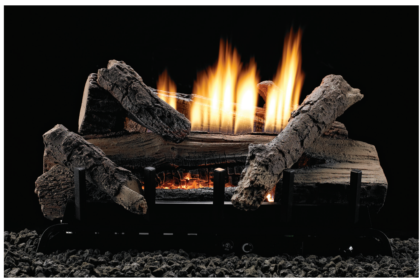
Concord Refractory Log Set and Vent-Free Burner combination (VFDR-18-LBW)

The Trenton and Concord are also offered in 10,000 Btu models for bedroom applications, where allowed by code.