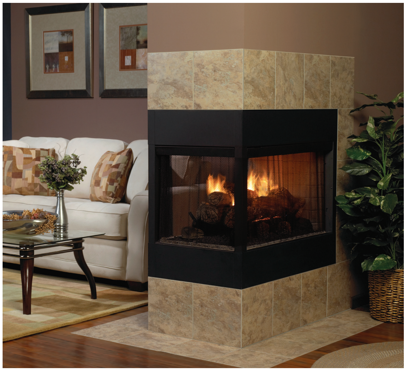
American Hearth Shiloh Log Set (LSU-24SF) on a Vent-Free Slope Glaze Vista Burner in a peninsula firebox with custom tile surround. The optional Log Embers Kit (EK-2) and Platinum Glowing Embers (PE20) add that extra spark of realism.