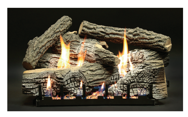
Super Stacked Wildwood Refractory Log Set (LS24WRS) with Vent-Free Slope Glaze Burner System (VFSR-24)