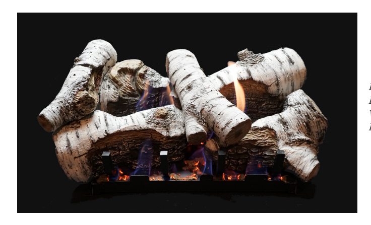
Birch Burncrete<sup>*</sup> Log Set (LS-18CD) with Vent-Free Slope Glaze Burner System (VFSR-18)