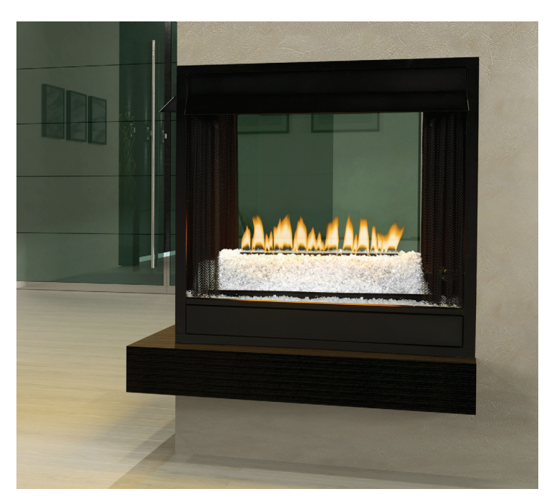
Loft Series Vent-Free Multi-sided burner (VFRU-24) with Clear Frost Decorative Glass (DG-30-CLF). Shown in a Vent-Free peninsula firebox with Flush Louvers.