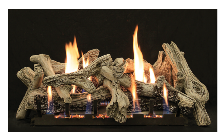
Driftwood Burncrete' Log Set (LS-24CD) with Vent-Free Slope Glaze Burner System (VFSR-24)