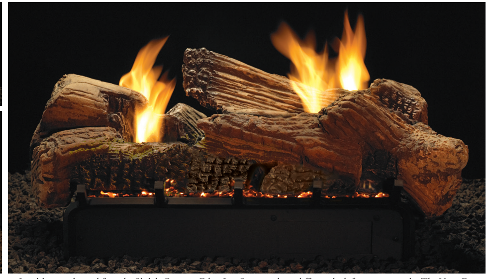
Just like a real wood fire, the Shiloh Ceramic Fiber Log Set provides a different look from every angle. The Vent-Free Slope Glaze Vista Burner neatly conceals its controls behind a sliding panel.