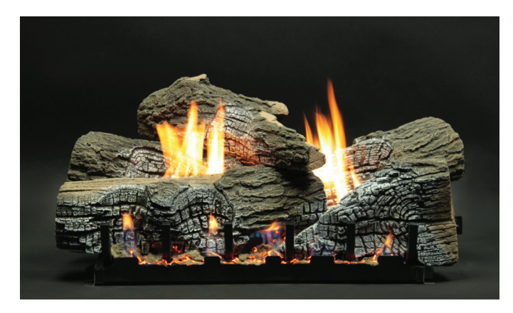
Stacked Wildwood Refractory Log Set (LS24WRR) with Vent-Free Slope Glaze Burner System (VFSR-24)