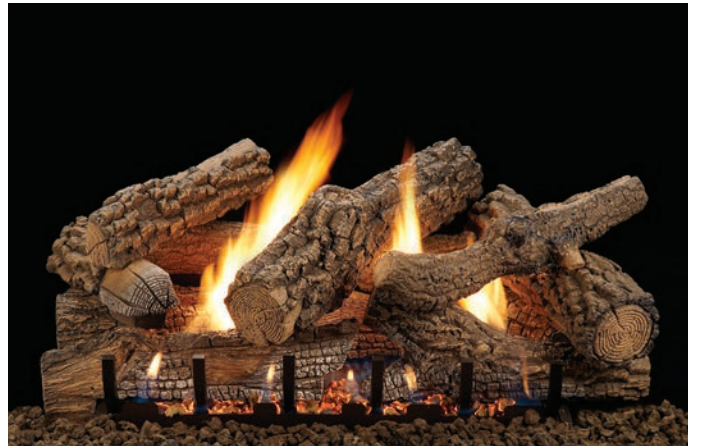
Saratoga Refractory Log Set (ALS24SG)