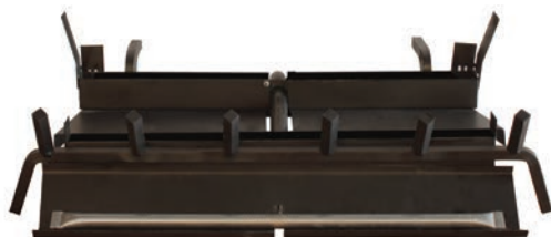
Triple Burner (AV)