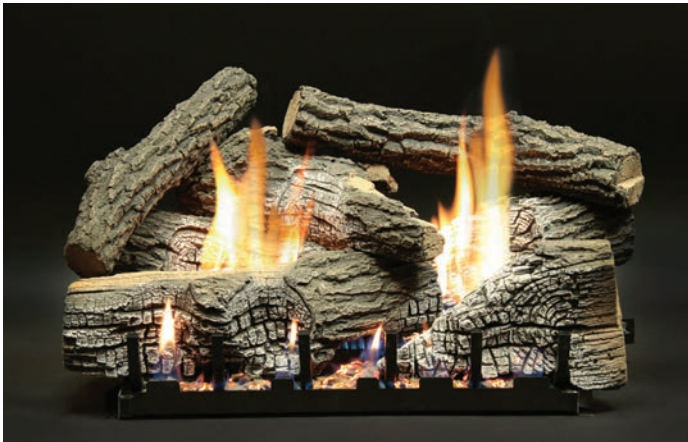
Super Stacked Wildwood Refractory Log Set (LS24WRS)