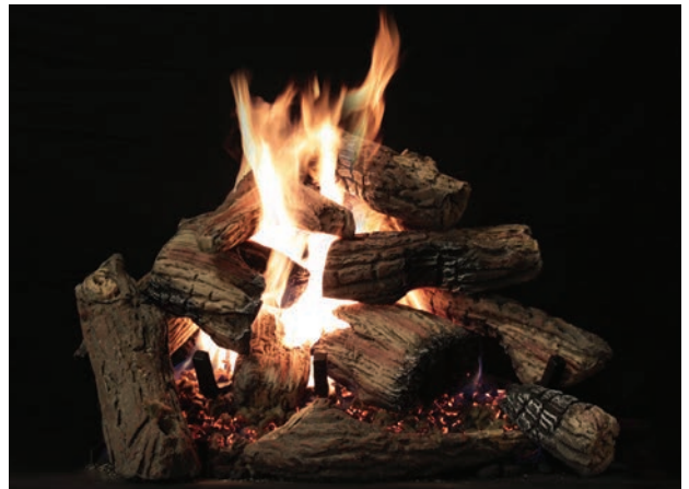
Kensington Forest (LKF) Ceramic Fiber Log Set