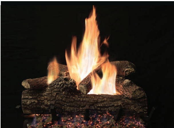
Great Lakes Oak (GLO) Refractory Log Set