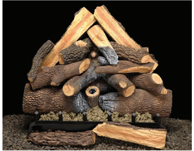
Advantage Refractory Log Set shown with Skyscraper (LAV) Accessory Refractory Logs