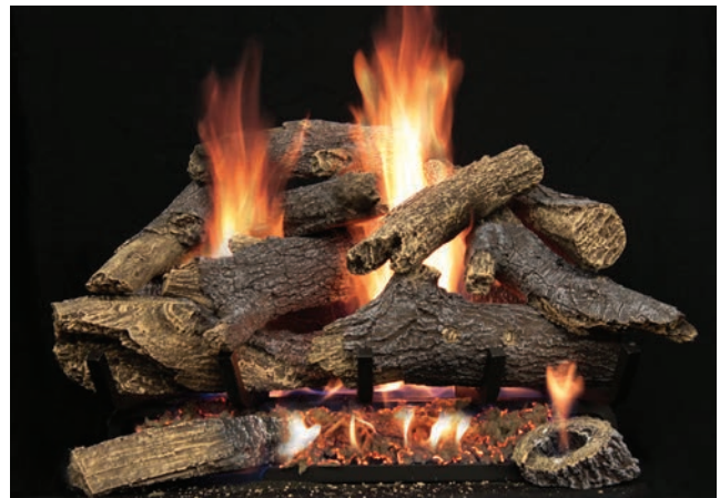
Pioneer (LPR) Refractory Log Set