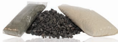
Embers, Rock and Sand (included with all Double and See-Through Burners)