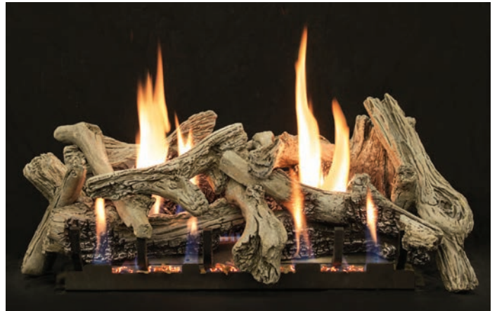
Driftwood Burncrete® Log Set (LS24CD)