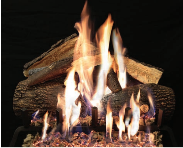
Advantage (LA) Refractory Log Set shown with Triple Burner