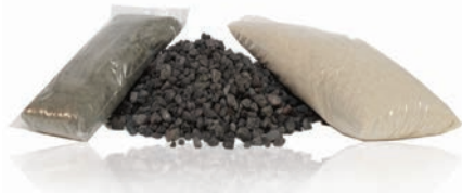
Embers, Rock and Sand (included with all Double and See-Through Burners)