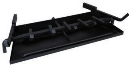
Double Burner (BX)

Our See-Through Burner features three tube burners in a rectangular sand pan to fit most see-through and peninsula fireplaces. Our see-through Log Sets include a second “Front Log.”