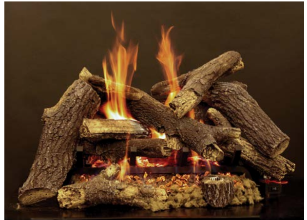
Pioneer (LPR) Refractory Log Set