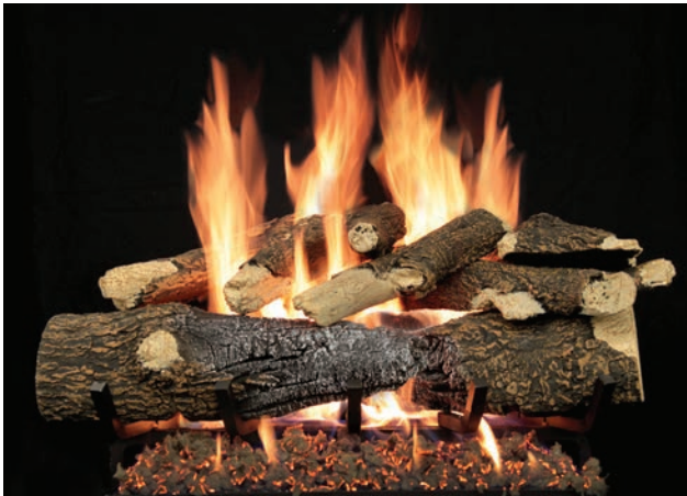
Frontier (LFR) Refractory Log Set