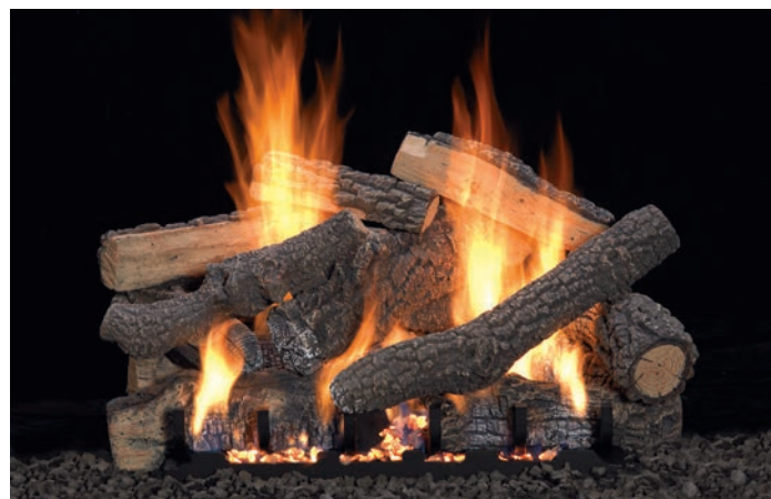
Ponderosa Refractory Log Set (LS24P)