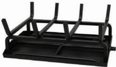
See-Through Burner (B3) (requires See-Through Log Set)