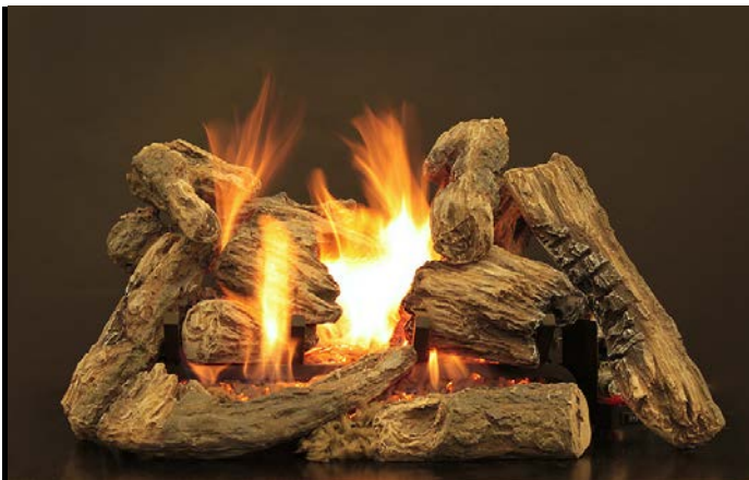
Kensington Forest 24-Inch (LKF) Ceramic Fiber Log Set