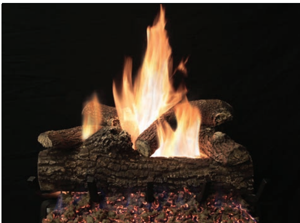
Great Lakes Oak (LGLO) Refractory Log Set