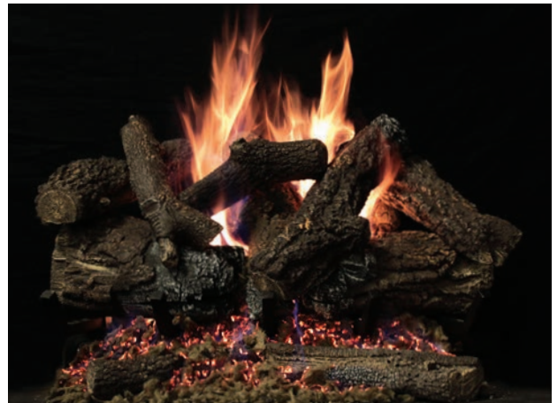
Treehouse 11 (LTH11) Refractory Log Set