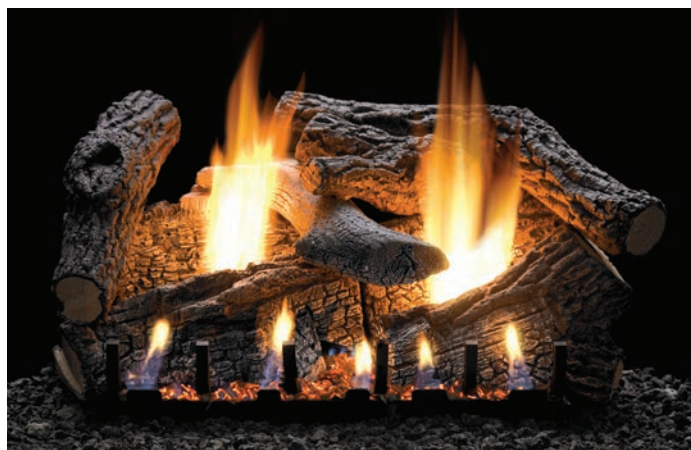
Super Sassafras Refractory Log Set (LS24RSS)