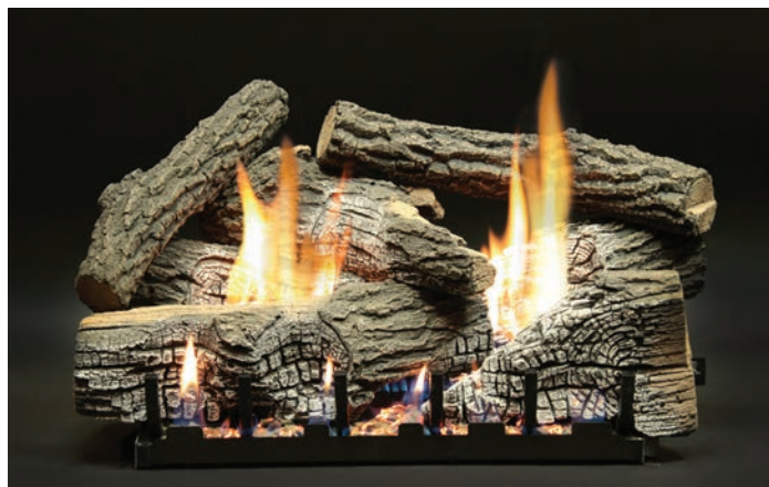
Super Stacked Wildwood Refractory Log Set (LS24WRS)