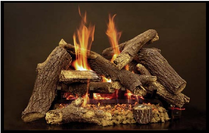
Pioneer 24-Inch (LPR) Refractory Log Set