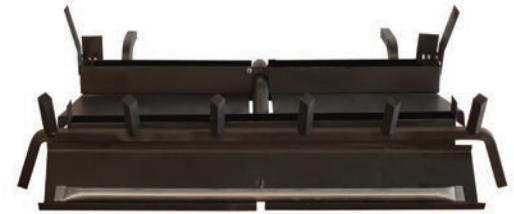
Triple Burner (AV)