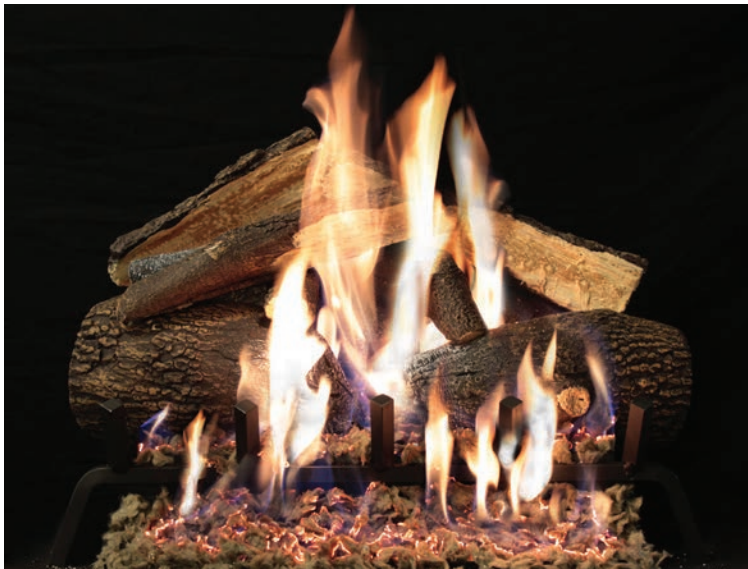
Advantage (LA) Refractory Log Set shown with Triple Burner