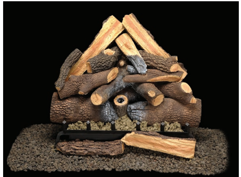
Advantage Refractory Log Set shown with Skyscraper (LAV) Accessory Refractory Logs