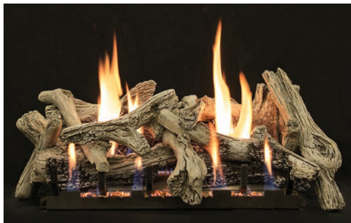
Driftwood Burncrete® Log Set (LS24CD)