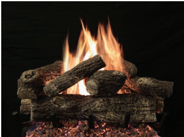
Treehouse 7 (LTH7) Refractory Log Set