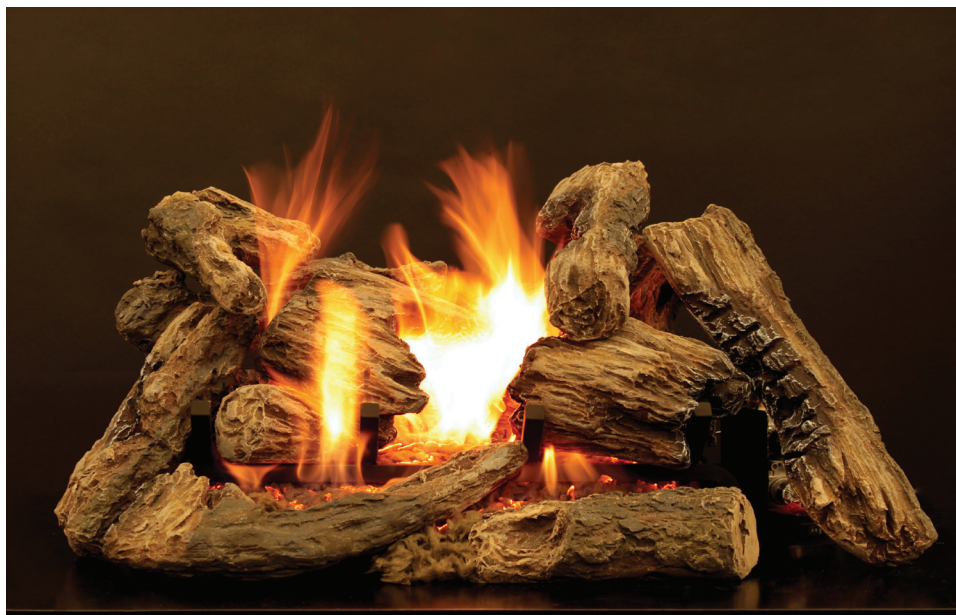
Kensington Forest Ceramic Fiber Vented Log Set on 24-inch Elite Radiant Vented Burner