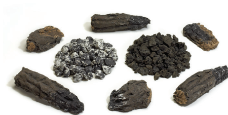
EK-1 Traditional Ember Bed Kit includes six burnt log pieces, white ash, and lava rock.