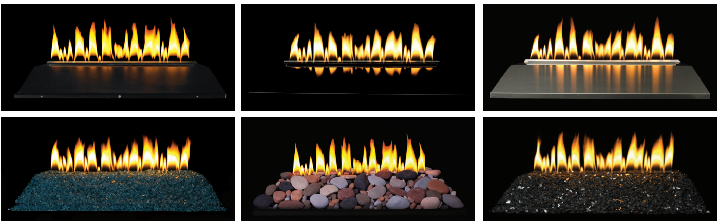
Top Row left to right: No Decorative Options, Polished Black Decorative Top, Brushed Stainless Steel Decorative Top. Bottom Row left to right: Blue Clear Decorative Glass, Medium Decorative Rocks and Accent Pebbles, Polished Black Decorative Glass. (Clear Frost Decorative Glass shown on opposite page)