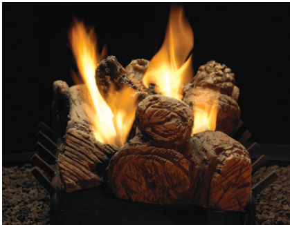
Opposite Side View (above) and End View (below)