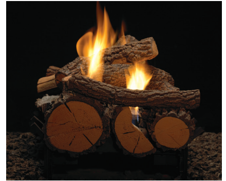
Opposite Side View (above) and End View (below)