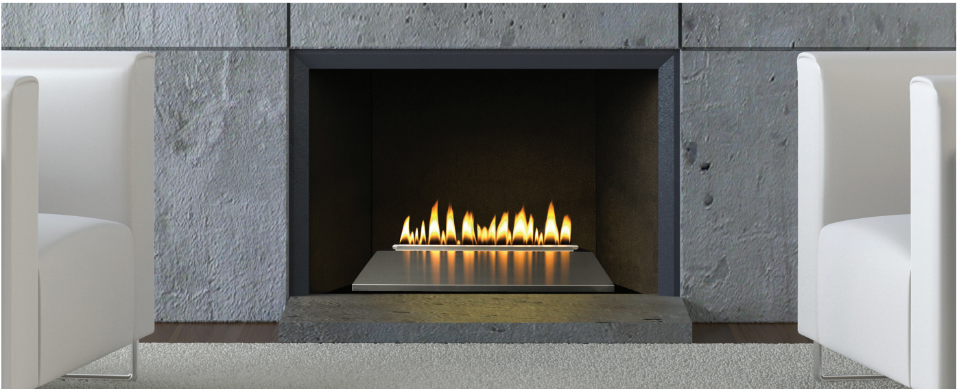
Loft Series Burner (VFRL-24) with Stainless Steel Decorative Top (DT-24-SS). Shown in existing masonry firebox.

A vent-free Millivolt Loft Burner may also be installed as a decorative appliance in a vented fireplace to provide ambiance and light – but without the heat. In a vented installation, the burner cannot be operated by thermostat and the flue damper must be blocked open. A damper clamp is included with each Millivolt Loft burner. Because IP Loft Burners include a thermostat and may not be installed as decorative appliances, a non-thermostat remote is available.