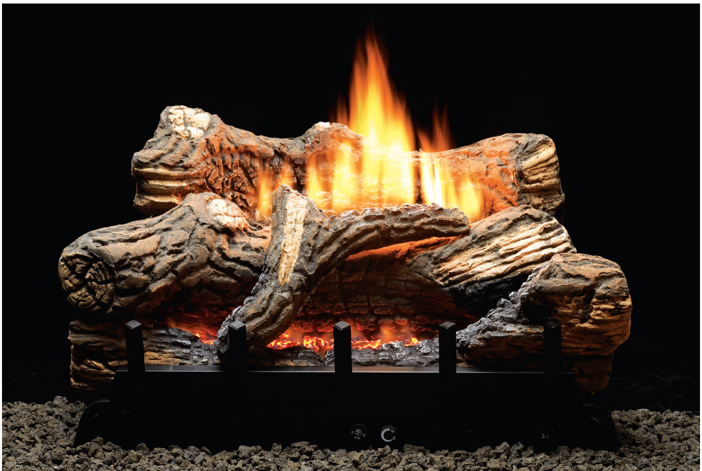
Ceramic Fiber Trenton Log Set and Vent-Free Burner Combination (VFDR-24LB)

The Trenton Log Set features richly detailed, hand-painted Ceramic Fiber logs mounted atop our Vent-Free Contour Burner. This complete set includes glowing embers to add to the illusion of a real wood fire at any heat setting. This competitively priced set is ideal for existing fireplaces and fireboxes and for new construction. Available in manual control, thermostat control, or remote-ready Millivolt – in 28,000 Btu, 34,000 Btu and 40,000 Btu.