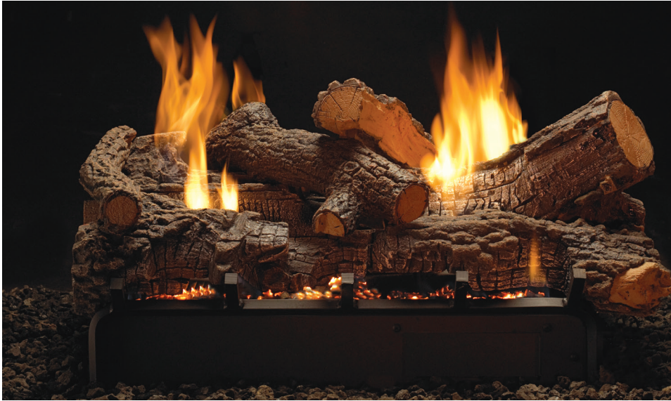
Rugged looking Refractory logs give the Raleigh Log Set a rustic look on a grand scale.