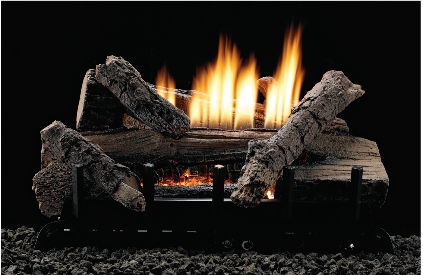
Refractory Concord Log Set and Vent-Free Burner combination (VFDR-18-LBW)

The Trenton and Concord are also offered in 10,000 Btu models for bedroom applications, where allowed by code.