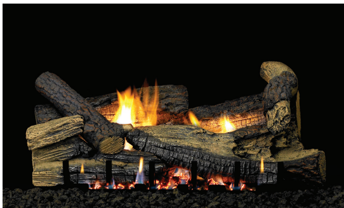
Refractory Yorktown Log Set (ALS-24YK) with Vent-Free Slope Glaze Burner System (VFSE-24)