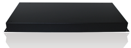
Log Riser (LR-24)

Member of the following industry associations: