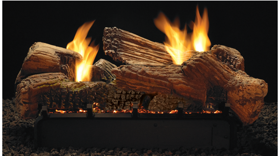
Just like a real wood fire, the Shiloh Ceramic Fiber Log Set provides a different look from every angle. The Vent-Free Slope Glaze Vista Burner neatly conceals its controls behind a sliding panel.