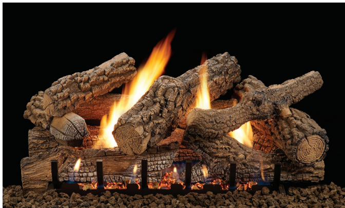
Refractory Saratoga Log Set (ALS-24SG) with Vent-Free Slope Glaze Burner System (VFSR-24)