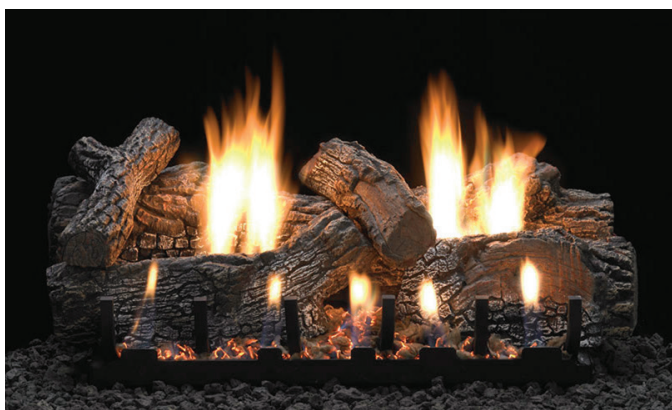
Refractory Charleston Log Set (ALS-24CR1) with Vent-Free Slope Glaze Burner System (VFSR-24)