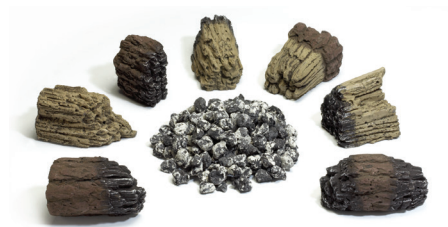
EK-2 Large Ember Kit available for Multi-sided log sets or large fireplaces.