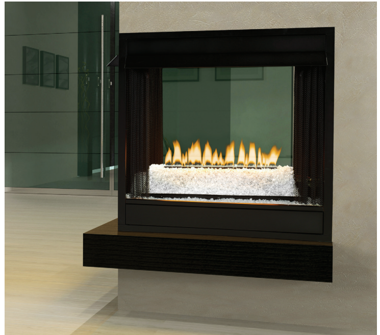
Loft Series Vent-Free Multi-sided burner (VFRU-24) with Clear Frost Decorative Glass (DG-30-CLF). Shown in a Vent-Free peninsula firebox with Flush Louvers.