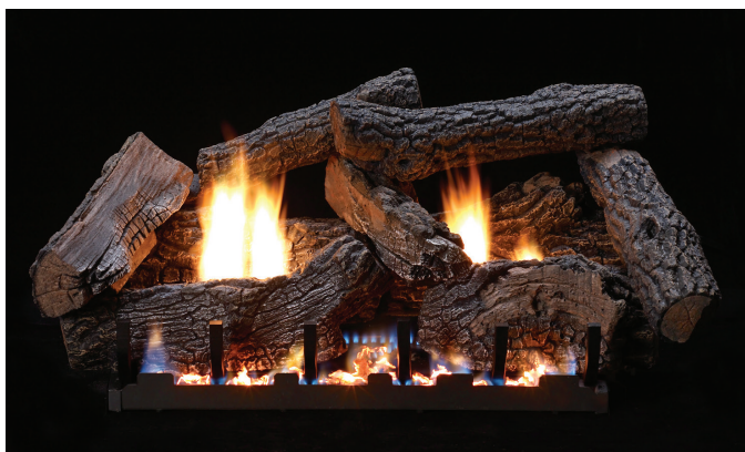
Refractory Charleston Select Log Set (ALS-24CR1S) with Vent-Free Slope Glaze Burner System (VFSR-24)