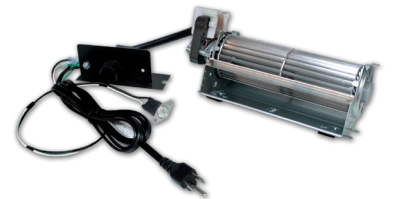
Optional variable-speed blower