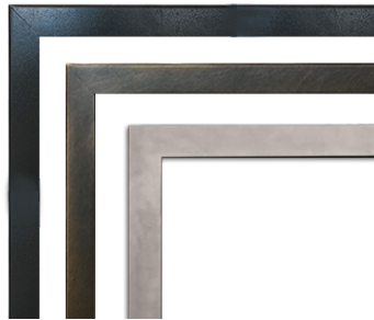
From L to R: 1.5 inch Beveled Window Frame in Textured Black 1.5 inch Beveled Window Frame in Oil Rubbed Bronze 1.5 inch Beveled Window Frame in Brushed Nickel (Oil Rubbed Bronze and Brushed Nickel not available in 72-inch models)