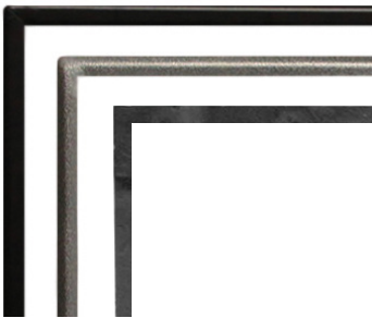
From L to R: 1-inch Trim in Matte Black 1-inch Hammered Pewter