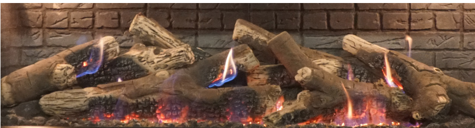
Traditional log set