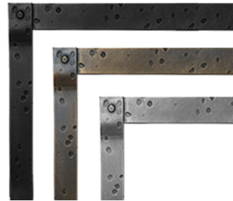
From L to R: 3-inch Forged Iron in Black 3-inch Oil Rubbed Bronze 3-inch Distressed Pewter