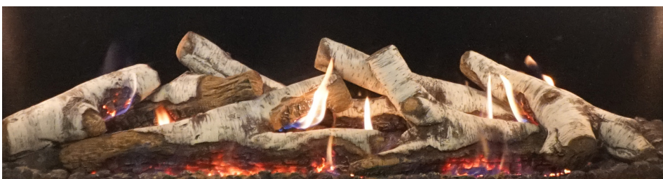
Birch log set